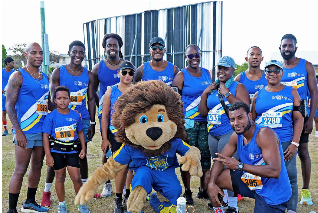
Leo the Lion strikes a pose with a group of participants at RBC's Race for the Kids 2024.