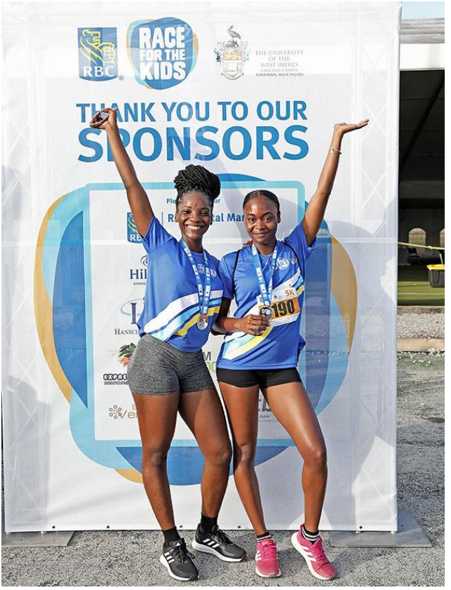
Victory captured: Female participants proudly showcase their medals after completing the race.