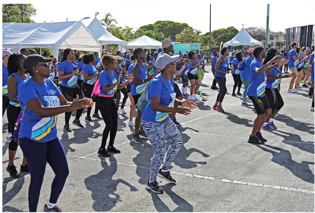
Participants warm up just before the start of RBC's Race for the Kids 2024.