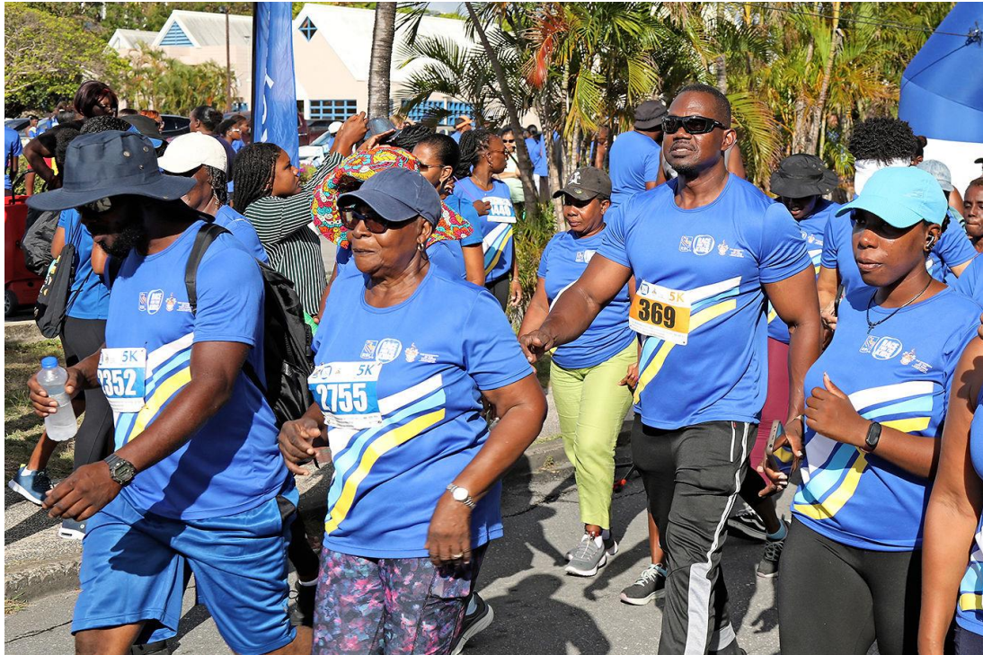
Scores of walkers participated in the 8th edition of RBC's Race for the Kids to benefit students at The UWI.