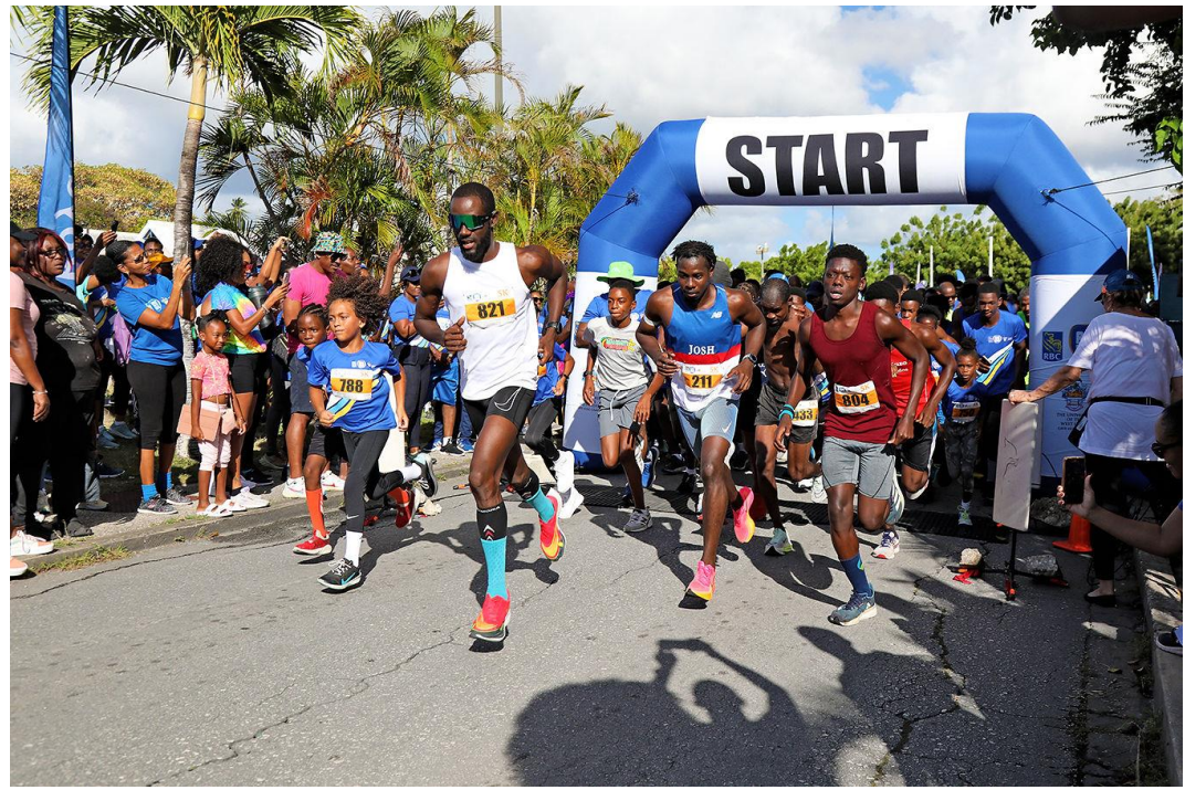
Runners set the pace at the starting line.